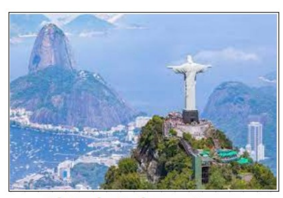
Christ the Redeemer Statue