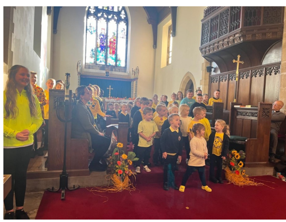
Harvest Festival St Johns church, Wales